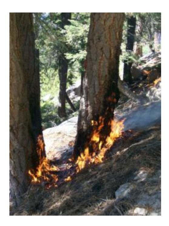
Understanding the relationship between Fire and Dead TreesA literature Review