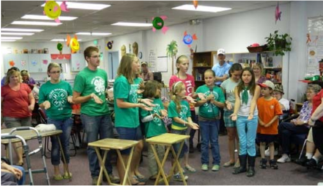
Ukiah Shamrock members visit the Senior Center to share about their projects and 4-H.